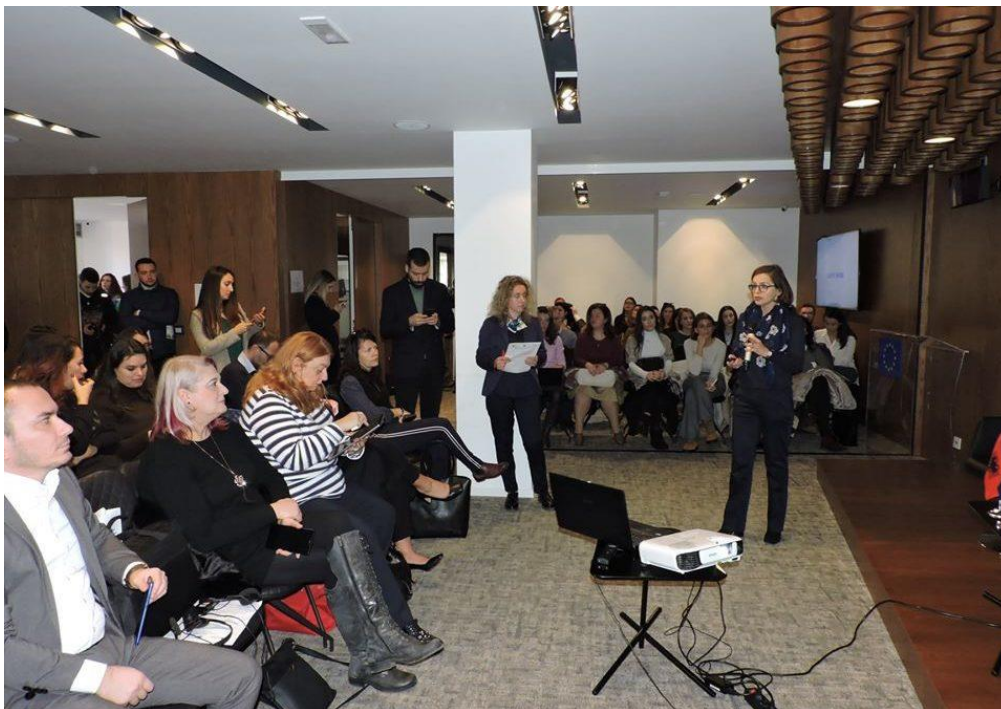
ALMARS representatives at Albania Erasmus+ Info Day

The activity offered networking opportunities with different universities in North Macedonia and know-how on benefiting from EU grants.