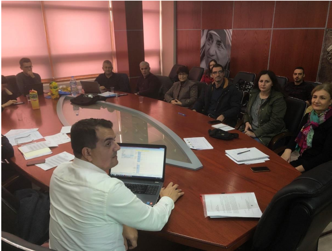
Project meeting in Tirana Albania, December 11-12, 2019.

Capacity building for Blue Growth and curriculum development of Marine Fishery in Albania - ALMARS