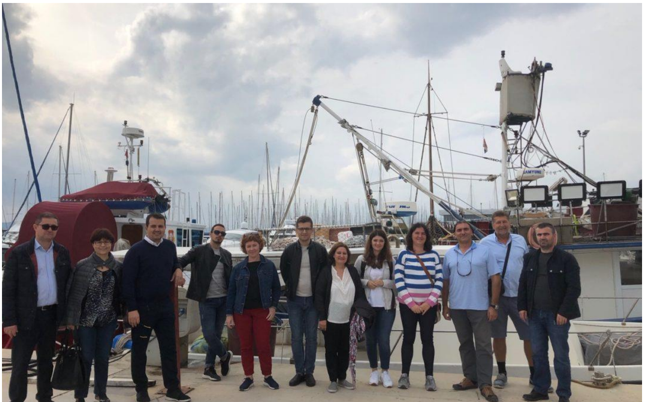
The visit of the fishing harbor in Kaštel Sućurac.

Furthermore, partners had the chance to visit facilities and laboratories used for graduate study of Marine fisheries. The participants had also an opportunity to visit the fishing industry facilities of Croatia that are stationed in the Split-Dalmatia county (fisherman, vessels, and harbor facilities).