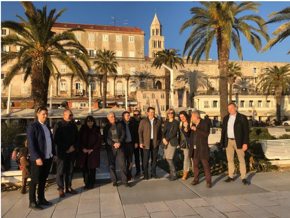
The participants of the Kick-Off meeting of ALMARS project in Split.