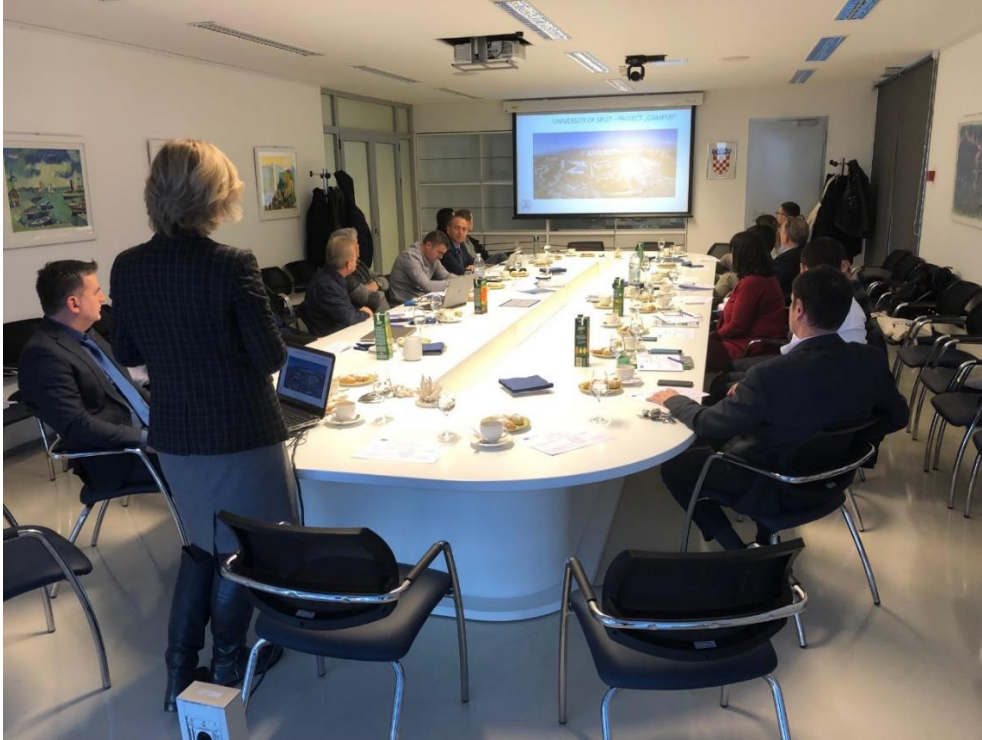
The Kick-Off meeting of ALMARS project at the premises of the University of Split.

Capacity building for Blue Growth and curriculum development of Marine Fishery in Albania - ALMARS